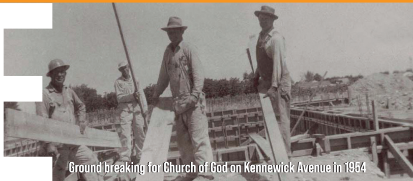
Ground breaking for Church of God on Kennewick Avenue in 1954